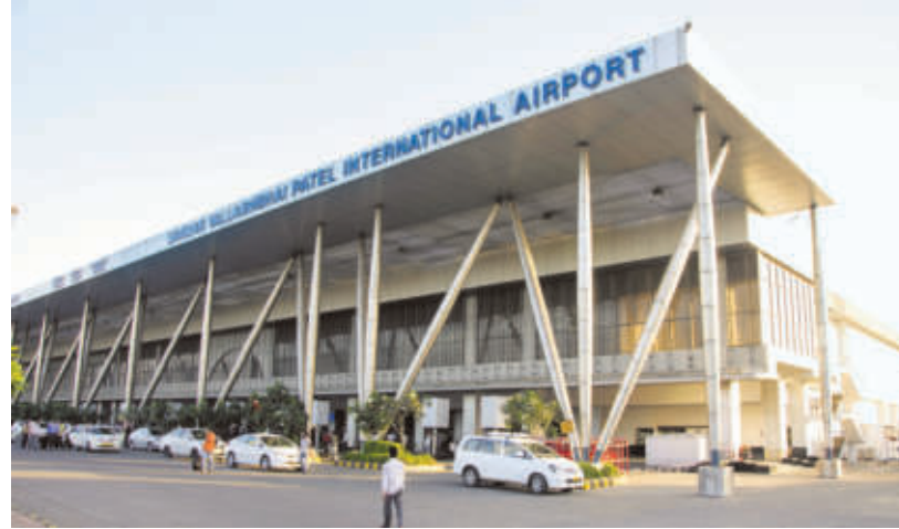
Adani Enterprises Ltd (AEL) will take control of the airports in Ahmedabad, Lucknow, Mangaluru, Jaipur, Thiruvananthapuram and Guwahati

In its FY20 annual report, AEL gave a glimpse of its ambition to be the largest private airport developer in the country, breaking the duopoly of the GMR and GVK business groups. The report lists its aim for the airports division as developing world-class infrastructure at airports, both at air-