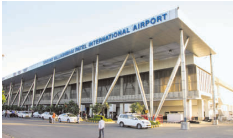
Adani Enterprises Ltd (AEL) will take control of the airports in Ahmedabad, Lucknow, Mangaluru, Jaipur, Thiruvananthapuram and Guwahati

In its FY20 annual report, AEL gave a glimpse of its ambition to be the largest private airport developer in the country, breaking the duopoly of the GMR and GVK business groups. The report lists its aim for the airports division as developing world-class infrastructure at airports, both at air-