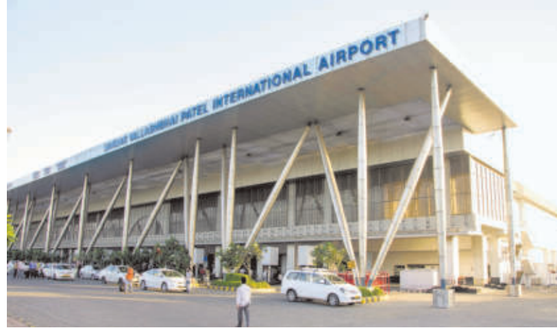
Adani Enterprises Ltd (AEL) will take control of the airports in Ahmedabad, Lucknow, Mangaluru, Jaipur, Thiruvananthapuram and Guwahati

In its FY20 annual report, AEL gave a glimpse of its ambition to be the largest private airport developer in the country, breaking the duopoly of the GMR and GVK business groups. The report lists its aim for the airports division as developing world-class infrastructure at airports, both at air-