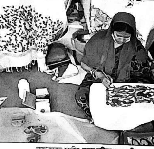
আসনসেবা হস্তশিল্প মেলায় খাটিকের কাজ মুটিয়ে তুলছেন শিল্পী-নির্মিত ছবি