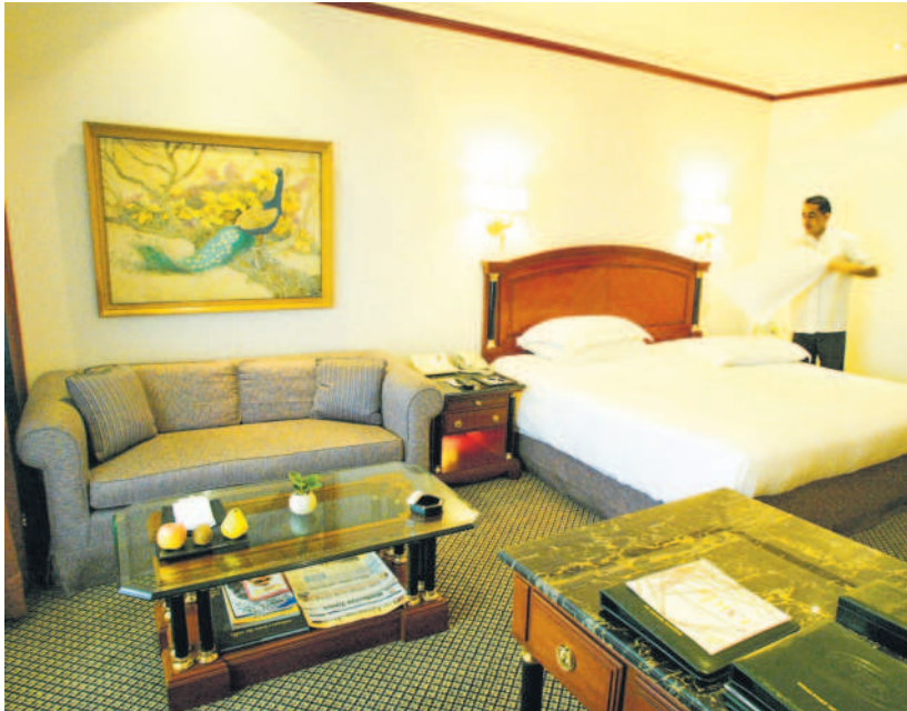
The hospitality sector currently pays interest of around 11%, which would be way lower if the infrastructure status is provided, say analysts. BLOOMBERG

The tourism ministry plans to discuss the long-standing demand for infrastructure status to the hospitality sector with other concerned departments, two government officials aware of the development said. Infrastructure status for any sector provides incentives and relaxations, including cheaper loans, tax concessions, and increased flow of capital. It also helps the sector attract investments. A deduction of up to 40% can be availed on the income derived by financial investments due to their investments in equity shares. The officials cited above said the ministry may take up the matter with the finance ministry and the Prime Minister's Office (PMO) to reach a consensus on the issue. The talks come at a time the hospitality business in the country has been severely impacted by the pandemic and the restrictions in the past two years.