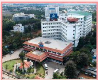
NARAYANA HRUDAYALAYA, BANGALORE