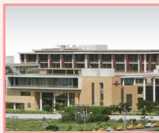
TATA MEDICAL CENTER, KOLKATA