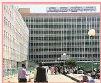
AIIMS, NEW DELHI