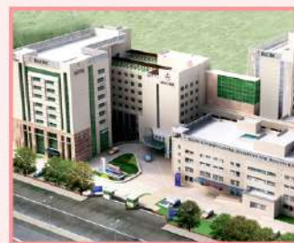
RAJIV GANDHI CANCER INSTITUTE, NEW DELHI